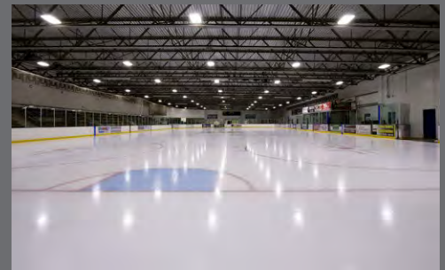
Ice at The RRRink now freezes faster

“The switch to R-448A calmed down the compressor cycling and was really impressive.”